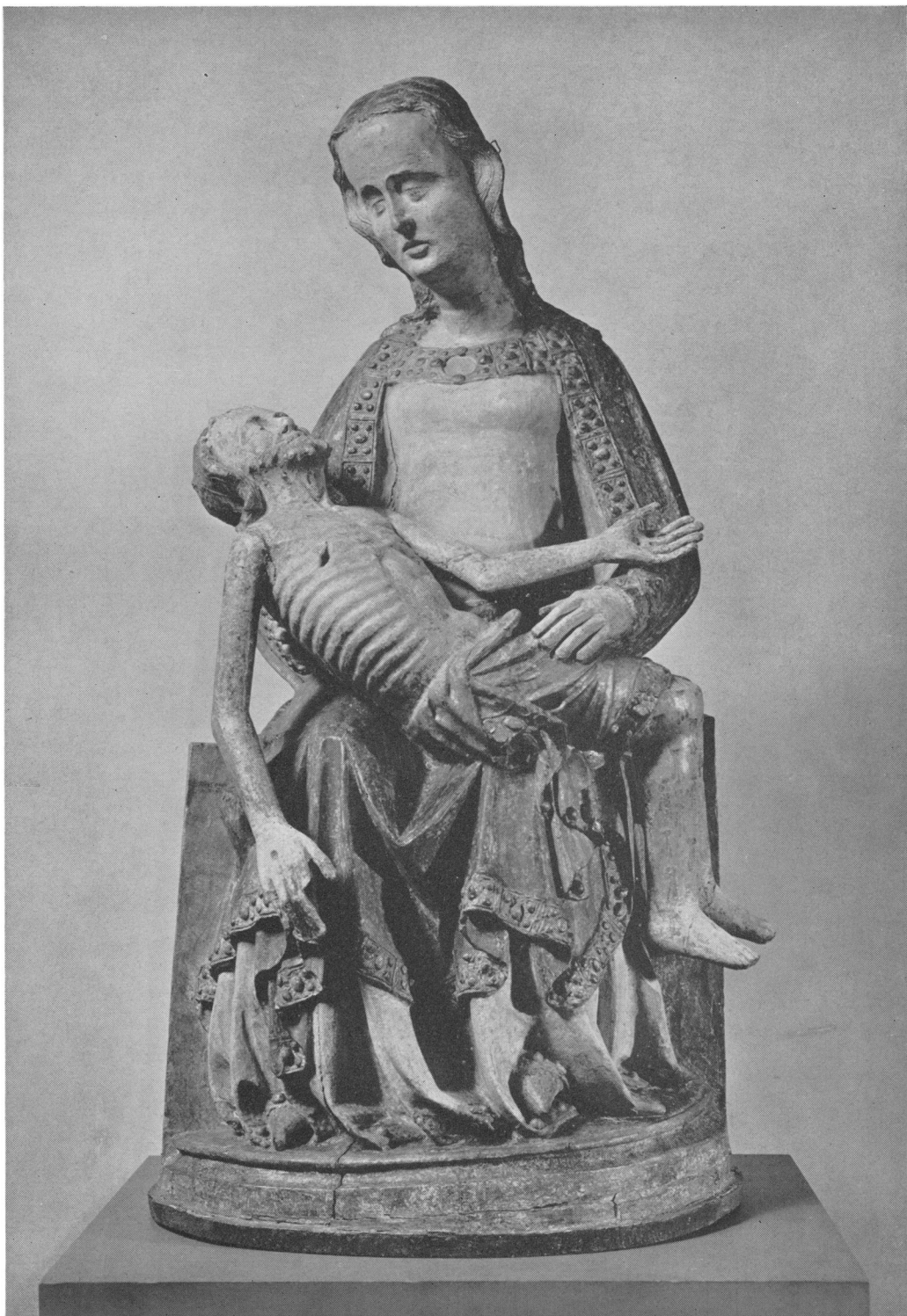
South German or Rhenish Pietà, a variation of the stepped type, 1375-1400. Painted wood. A reliquary was once attached to the statue. The Cloisters. Rogers Fund, 1948