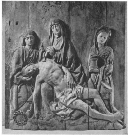
French relief, late diagonal type, related to Deposition and Lamentation scenes. Early XVI century. Painted wood. Main Building

The last medieval Pietà belonging to the Museum to be considered here is a relief in which Mary no longer supports the full weight of the body but allows it to rest on the ground against her knee. The faint outline of a cross painted behind Mary suggests the relation of the scene to the Deposition from the Cross. The positions of John the Evangelist and Mary Magdalene are much the same as they are usually represented in the next episode of the Passion, the Entombment, or Burial. As in the burial scene, the Magdalene carries her ointment jar half-opened as if about to anoint Christ's body. The Virgin's clasped hands suggest the dramatic mood of the Lamentation scene, dear to Italian painters, who developed it from their Byzantine inheritance. This group may still be called a Pietà rather than a Lamentation because Mary is still the dominating figure. How-