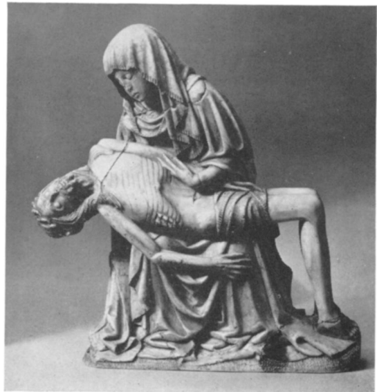
BELOW: German Pietà of the horizontal type. XV century. Alabaster (legs and shoulder of Christ restored). At the Main Building

Although French Pietàs are largely derived from the German, the transformations they undergo eventually free them from the stiff-