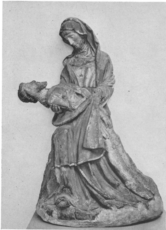
French Pietà of a diagonal type, related to a Rhenish-Westphalian group. Early xv century. Painted wood. At The Cloisters

ness and intense feeling so characteristic of their German prototypes. It has been supposed that French Pietàs were derived directly from the fifteenth-century mystery plays of the Passion, but such a derivation ignores the existence of the German Pietàs, many of them datable in the fourteenth century, a hundred years or more before the subject became popu-